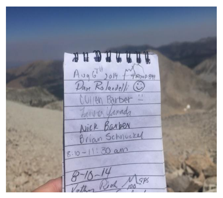
Mount Stanford | The registry shows Troop 849's last climb in 2014.

Upcoming Fundraiser: Hometown fair Burger Booth